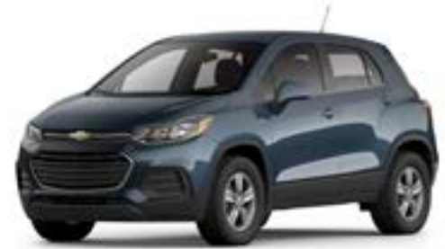
Shadow Gray Metallic