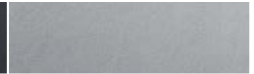
Light Ash Gray Leatherette Seating Surfaces 2