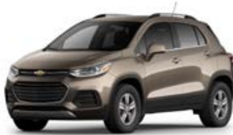
Stone Gray Metallic