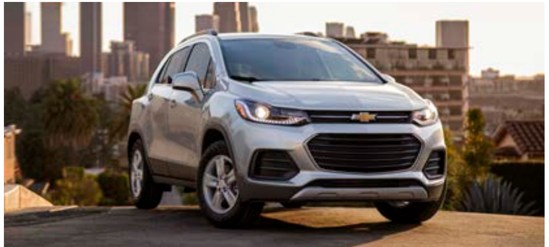
Trax LT in Silver Ice Metallic.

1 EPA-estimated 24 MPG city/32 highway (FWD). EPA-estimated 23 MPG city/30 highway (AWD). 2 Cargo and load capacity limited by weight and distribution. 3 Vehicle user interface is a product of Apple and its terms and privacy statements apply. Requires compatible iPhone and data plan rates apply. 4 Vehicle user interface is a product of Google and its terms and privacy statements apply. Requires the Android Auto app on Google Play and a compatible Android smartphone. Data plan rates apply. You can check which smartphones are compatible at g.co/androidauto/requirements . 5 Service varies with conditions and location. Requires active service and paid AT&T data plan. Visit onstar.com for details and limitations. 6 A NOTE ON CHILD SAFETY: Always use seat belts and the correct child restraint for your child's age and size, even with airbags. Even in vehicles equipped with the Passenger Sensing System, children are safer when properly secured in a rear seat in the appropriate infant, child or booster seat. Never place a rear-facing infant restraint in the front seat of any vehicle equipped with an active frontal airbag. See your vehicle Owner's Manual and the child safety seat instructions for more safety information. 7 2015–2022 model years. Government 5-Star Safety Ratings are part of the National Highway Traffic Safety Administration's (NHTSA's) New Car Assessment Program ( www.nhtsa.gov ).