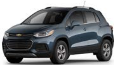
Shadow Gray Metallic