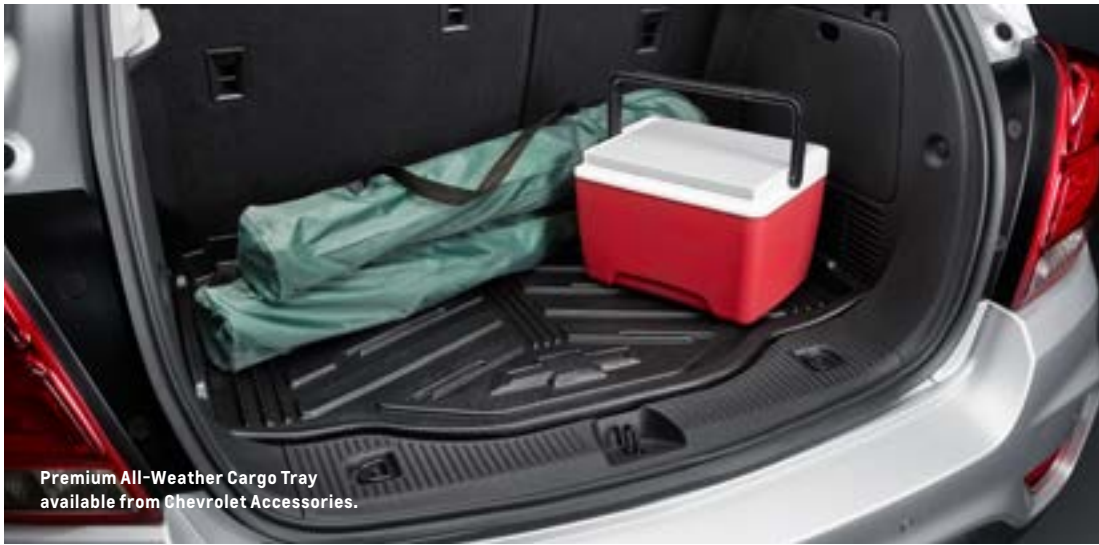
Premium All-Weather Cargo Tray available from Chevrolet Accessories.