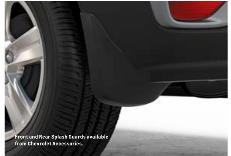
Front and Rear Splash Guards available from Chevrolet Accessories.