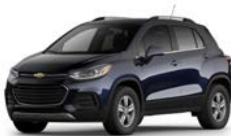
Midnight Blue Metallic