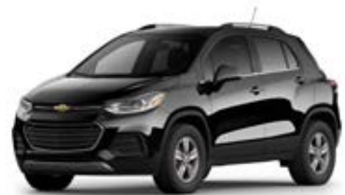
Mosaic Black Metallic