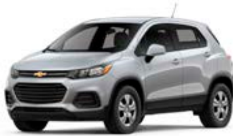
Silver Ice Metallic