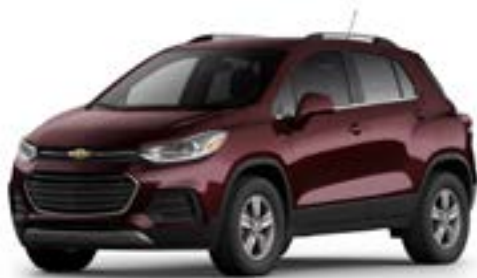
Black Cherry Metallic