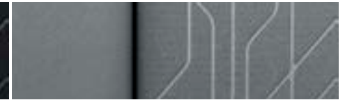
Light Ash Gray Deluxe Cloth/Leatherette Seating Surfaces