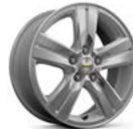
16" Aluminum Wheels Standard on LT